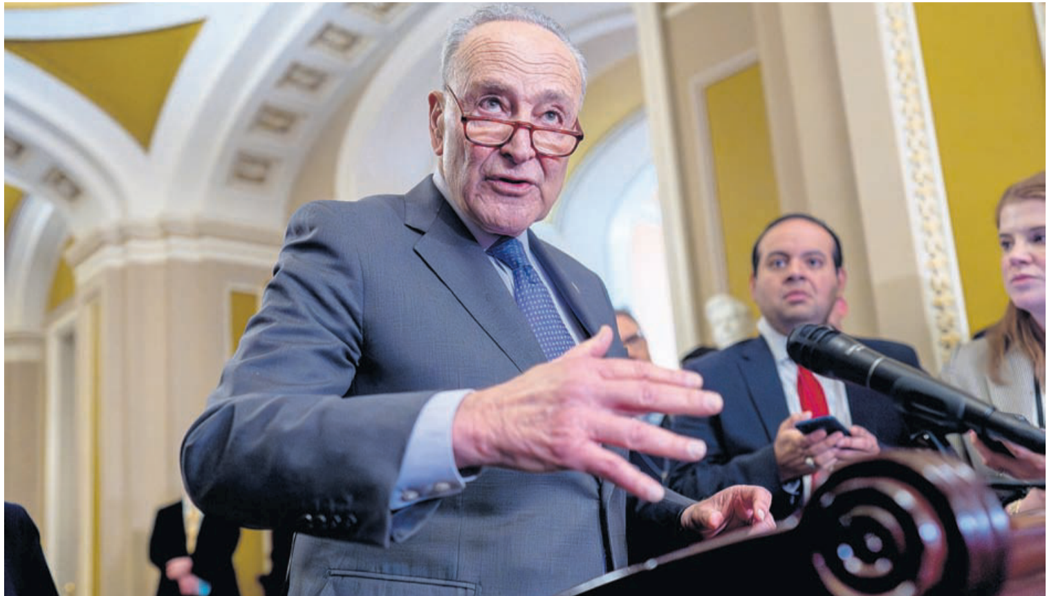
Senate Majority Leader Chuck Schumer, D-N.Y., meets with reporters to discuss efforts to pass the final set of spending bills to avoid a partial government shutdown, at the Capitol in Washington, Wednesday, March 20, 2024.